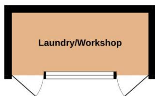
Ground floor 433 sq.ft. (40.2 sq.m.) approx.